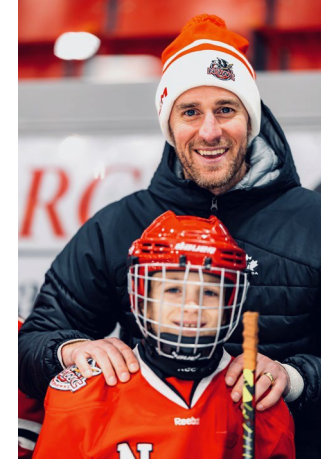
Capital City Condors Honourary Captain Forward, Retired NHL